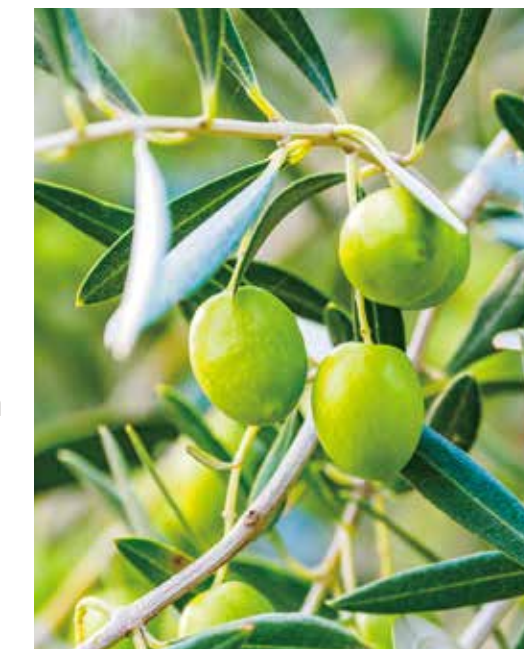
Olives nearing harvest