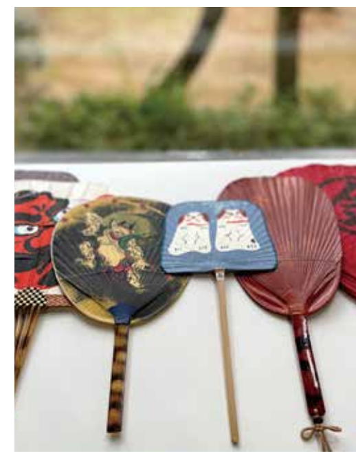
Marugame uchiwa fans