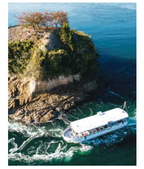
Tidai Current Experience