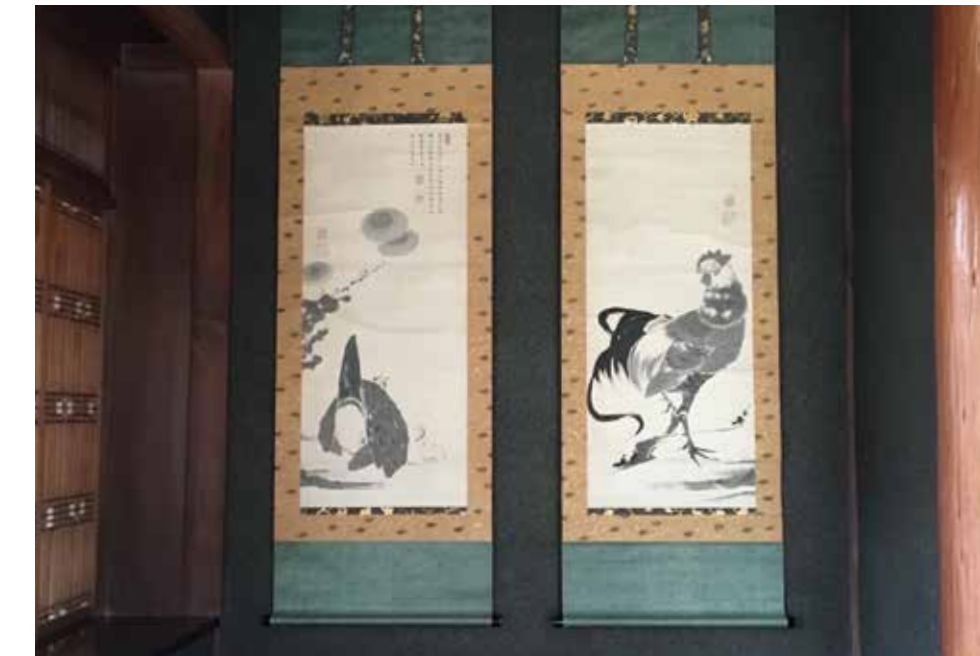
Ito Jakuchu "Rooster and Hen"