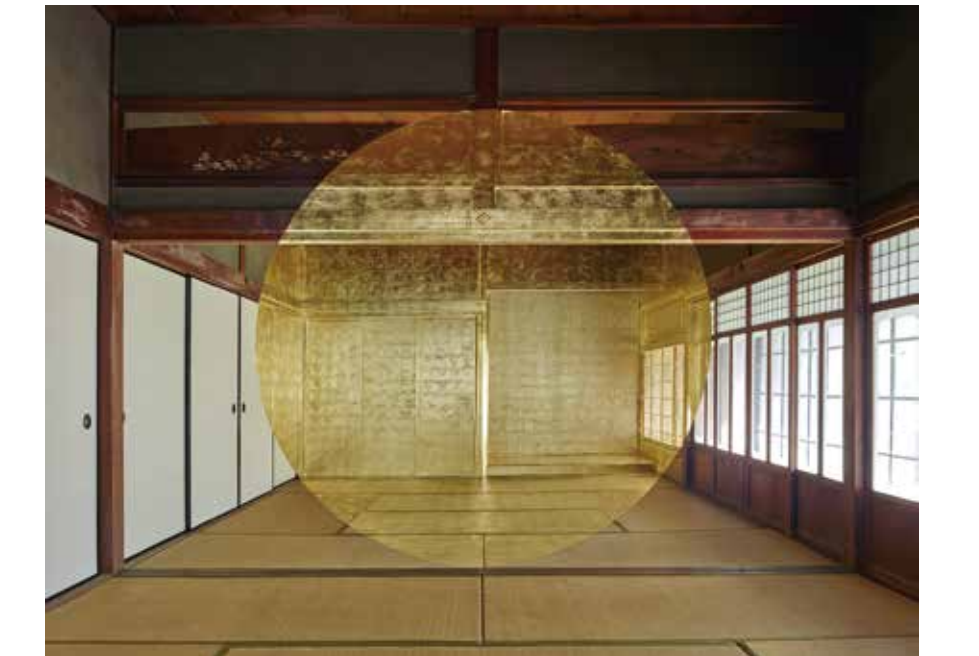
Georges Gallery