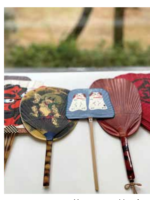
Marugame uchiwa fans