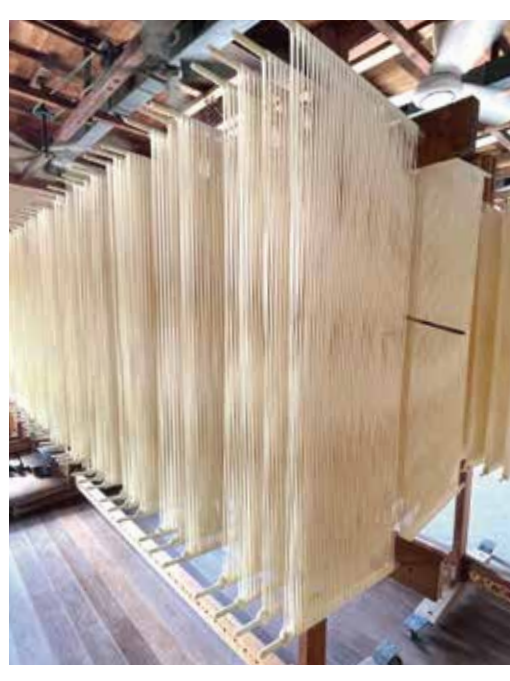
The process of somen noodles