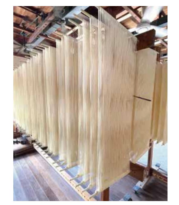
The process of Somen noodles