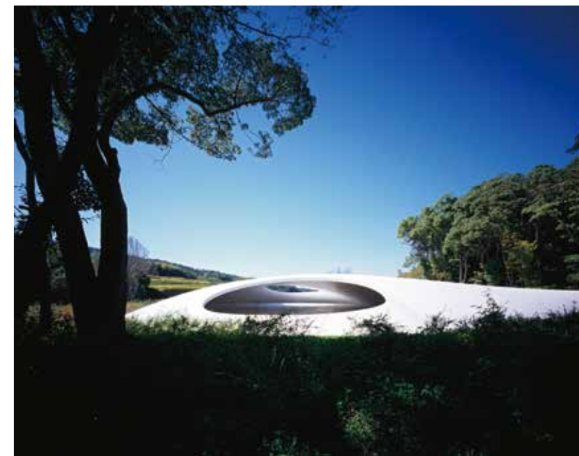
Teshima Art Museum