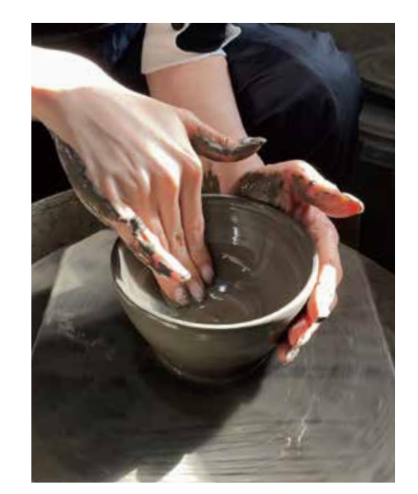
Experience of Bizen pottery