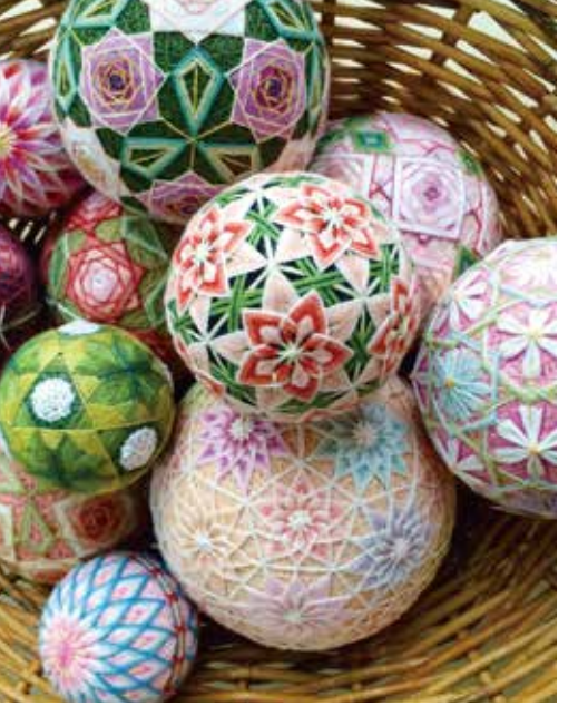
Sanuki Kagari Temari

*The destinations of activities change depending on day of departure. Details will be shared after boarding.