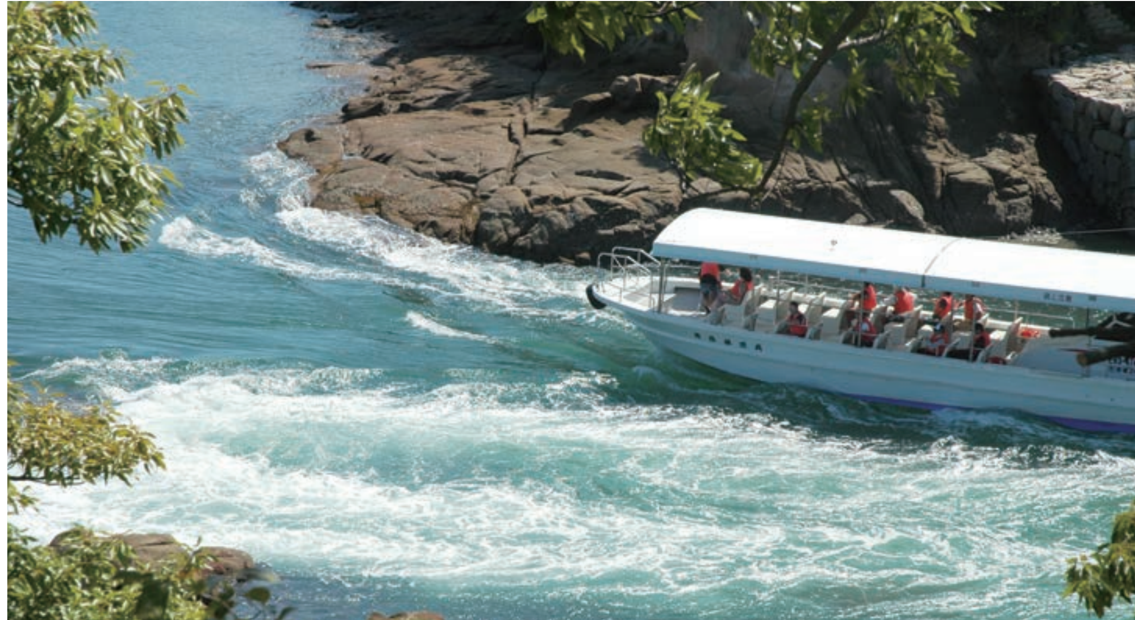
Tidai Current Experience