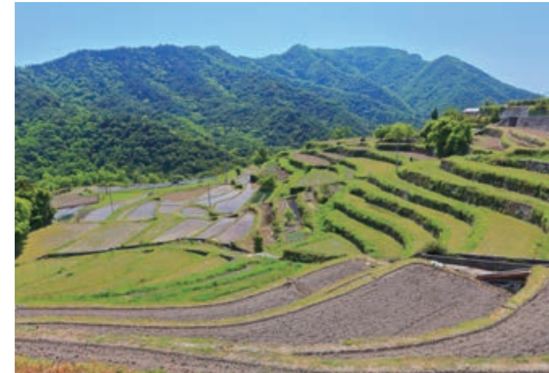
Nakayama Terraced Rice Paddies