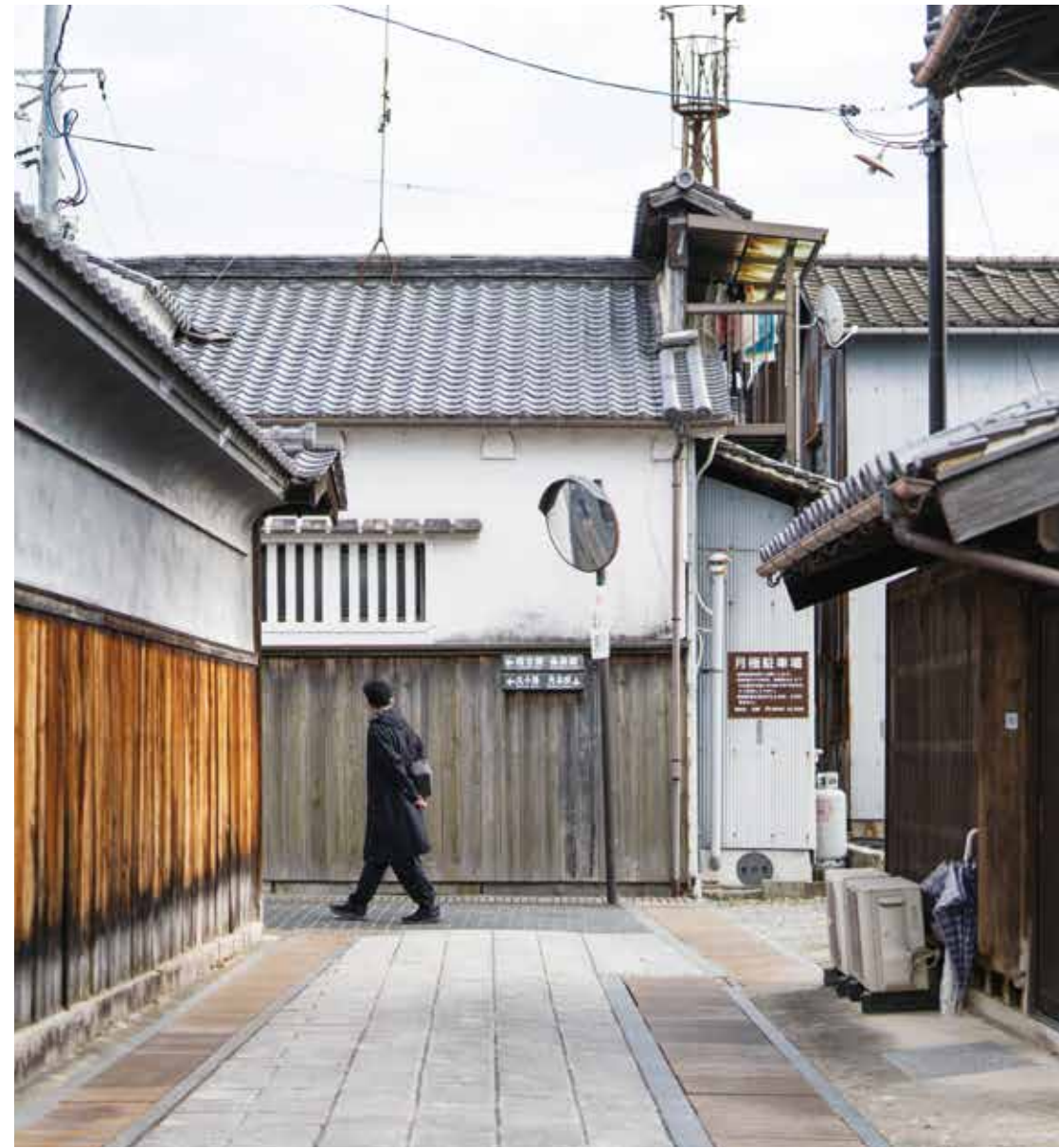
Townscape of Takehara

This three-day voyage sails west from Onomichi. Departing Bella Vista Marina, guntô navigates through the Onomichi Strait and Ondo Strait on its way to the waters off Miyajima. On the second day, it passes through the string of islands known as the Tobishima Kaido as it returns towards Takehara in Hiroshima. This is a journey to savor the beauty of island-studded seascapes while experiencing the timeless wonders that tie together more than a millennium of Setouchi history.