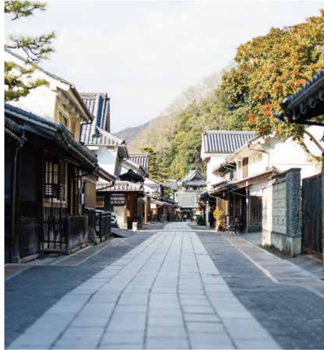
Townscape of Takehara

This three-day voyage sails west from Onomichi. Departing Bella Vista Marina, guntū navigates through the Onomichi Strait and Ondo Strait on its way to the waters off Miyajima. On the second day, it passes through the string of islands known as the Tobishima Kaido as it returns towards Takehara in Hiroshima. This is a journey to savor the beauty of island-studded seascapes while experiencing the timeless wonders that tie together more than a millennium of Setouchi history.