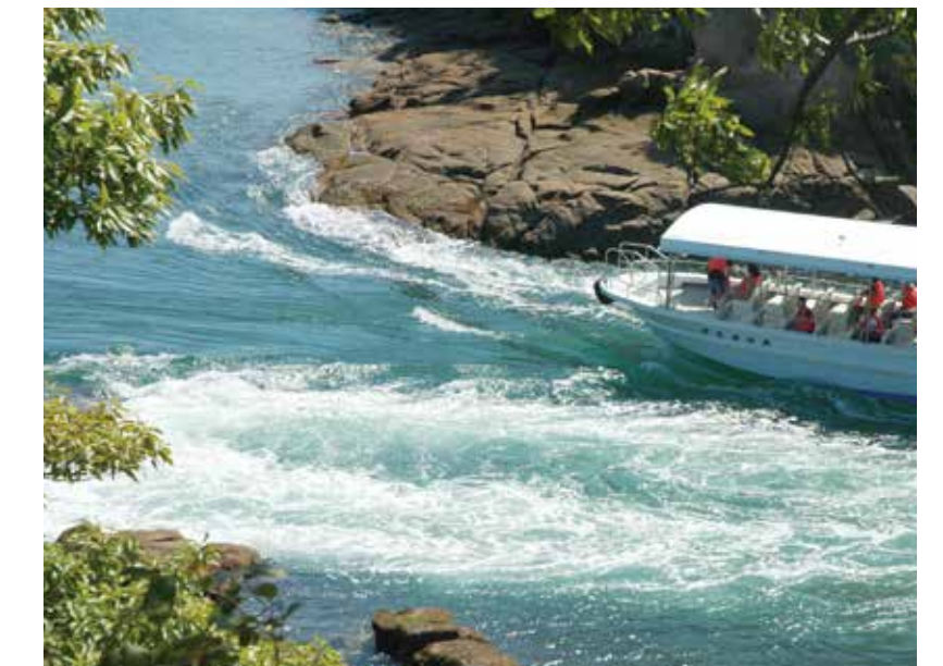
Tidal Current Experience

*Between July and September, off-ship activities may be cancelled in the event of extreme heat.