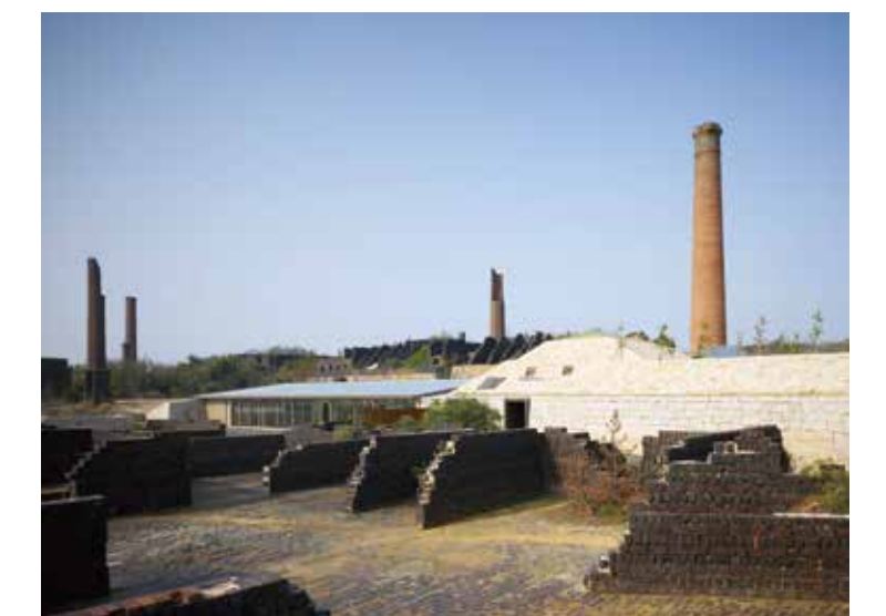
Inujima Seirenscho Art Museum