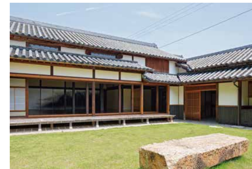
Art House Project "Ishibashi"