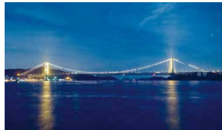
Great Seto Bridge at night