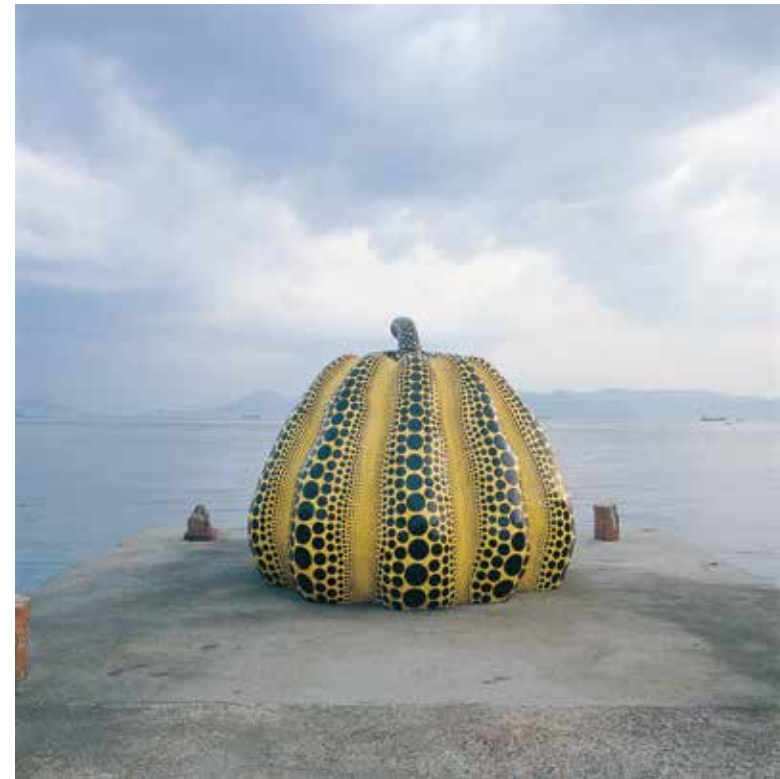
Yayoi Kusama "Pumpkin"

Eastward route (3 nights 4 days) : anchor offshore at Tamano, Tamano and Takuma Bay