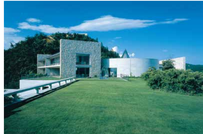
Benesse House

This voyage devotes two days to visiting world-famous art islands. After departing Bella Vista Marina, pass beneath the Great Seto Bridge at night before anchoring off Tamano in Okayama Prefecture. On the second and third days, hop between art islands such as Naoshima and Teshima using guntū's speedboats. Appreciate art at sites including the Chichu Art Museum, Art House Project on Naoshima, the Teshima Art Museum, the Inujima Seirenscho Art Museum and Inujima Art House Project on Inujima.