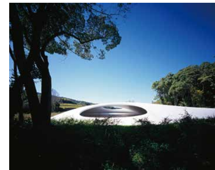
Teshima Art Museum

Tour includes : 3 breakfasts, 2 lunches, 3 dinners