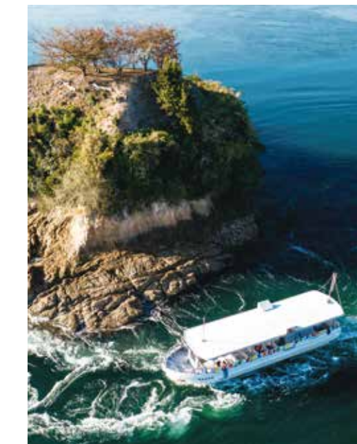
Tidai Current Experience