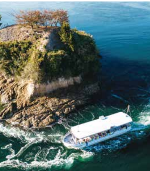
Tidai Current Experience