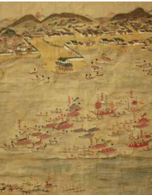
Korean mission to Japan