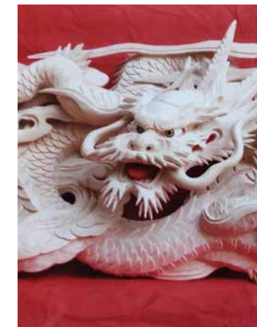
Woodcarving for Saijo Festival Floats