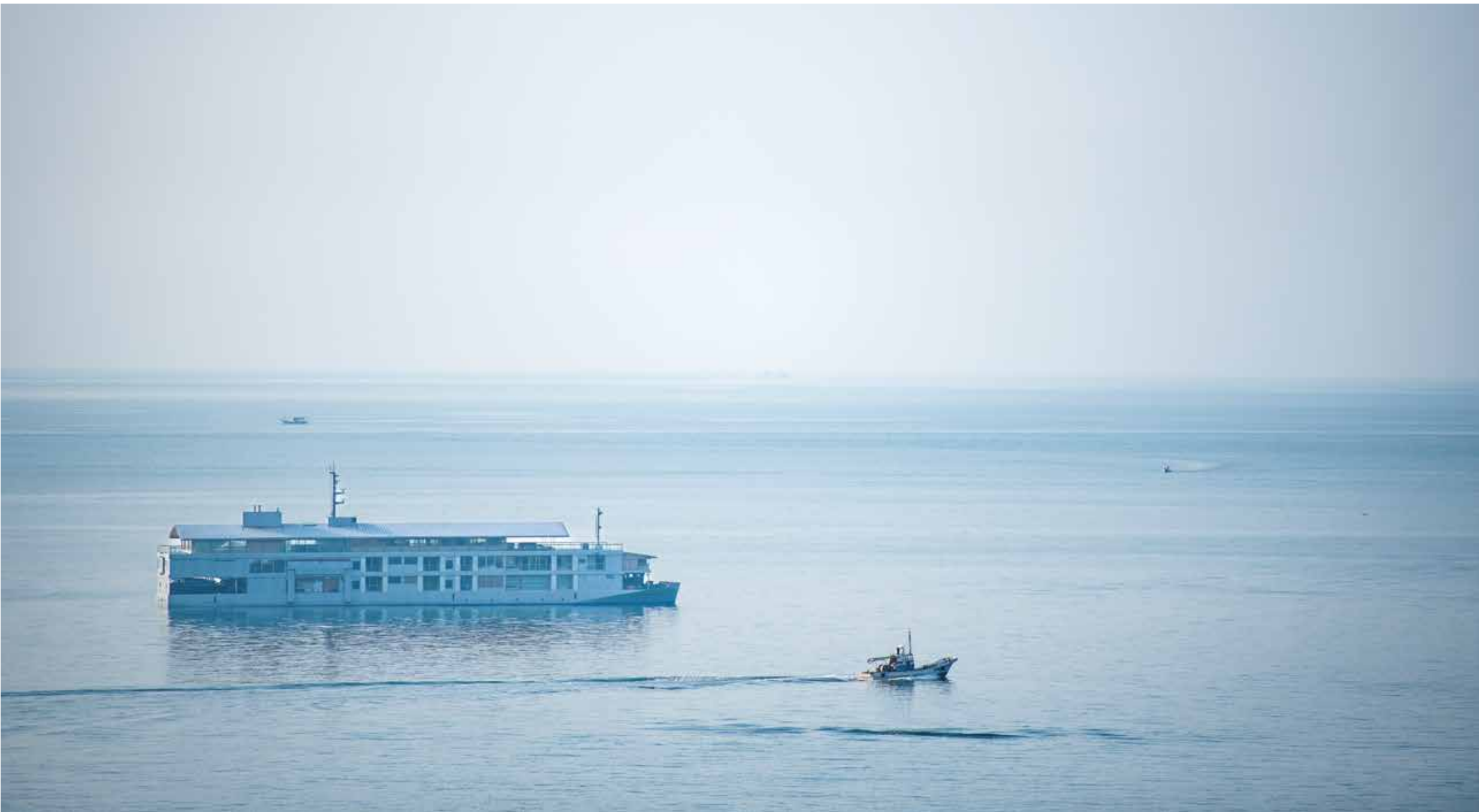
Seasons shifting on the Seto Inland Sea

This drifting route explores the waters at the very heart of the Seto Inland Sea, sailing among the sleek bridges that link the Geiyo Islands, through the open waters of Hiuchinada, and under the majestic Great Seto Bridge. This region is notable for the diversity of its cultural heritage. Off-ship activities are chosen for the season, such as visits to artisans who carry on the craftsmanship of local festivals and traditions, and walks through historical townscapes. This leisurely voyage across the sea lets you savor the varied beauty of Setouchi in a single itinerary.