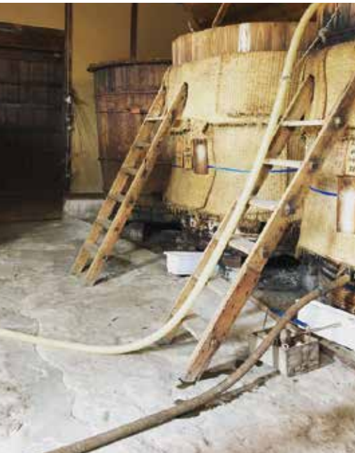
Vinegar made in cedar casks in Nio