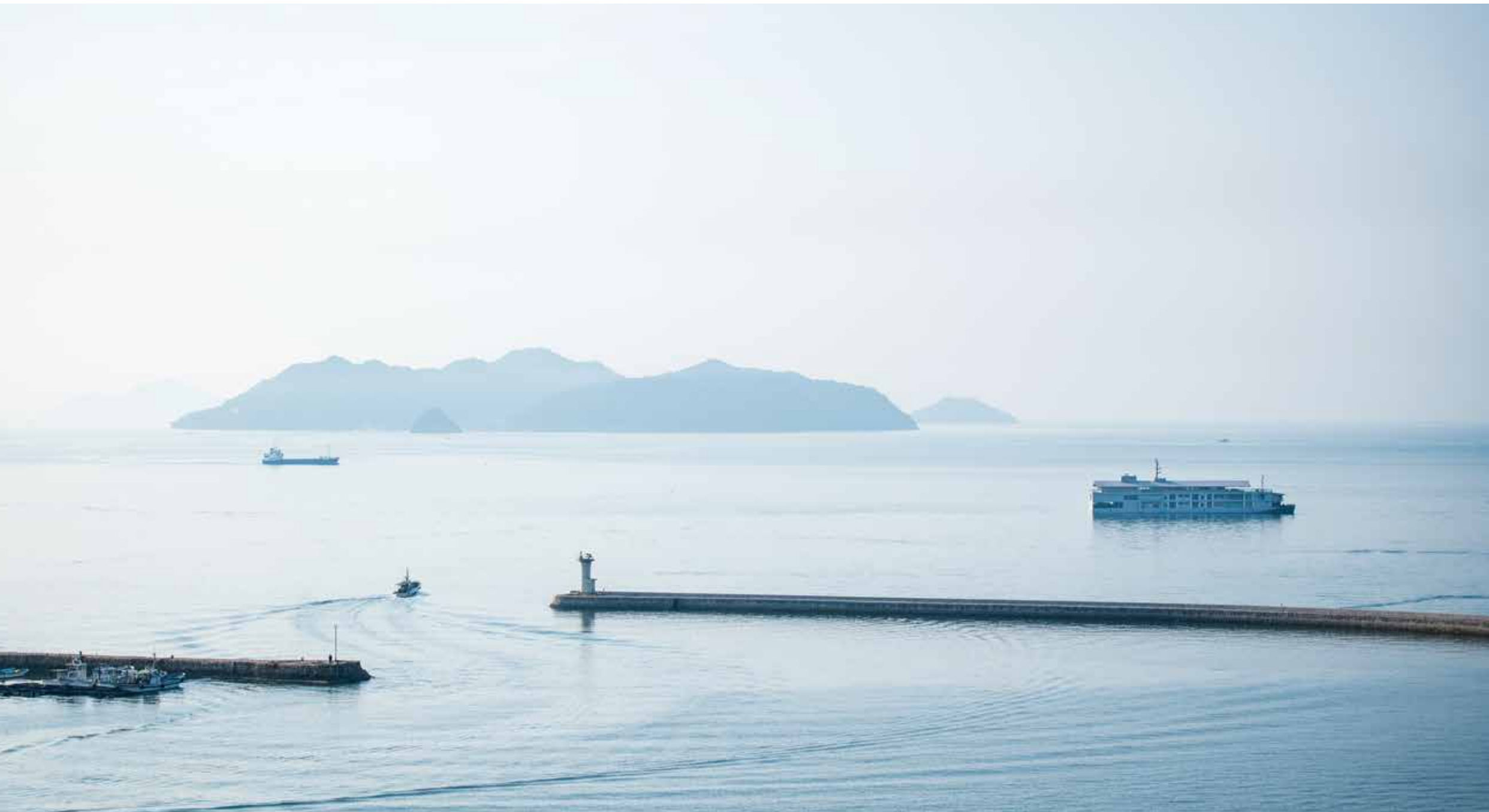
Guntû on the Seto Inland Sea

This unique voyage embodies guntû’s signature travel style known as “Setouchi roaming.” Beyond the Onomichi Strait await the winding waterways of the Geiyo Islands, where inter-locking islands form a breathtaking seascape. After anchoring in the quiet darkness of the Kasaoka Islands, this slow-paced route continues through a shifting scenic backdrop. Sailing eastward, guntû passes under the Great Seto Bridge and along the coast of Shodoshima as far as Hinase. The seasons of summer and autumn in the Inland Sea are fully palpable aboard the ship. This four-day voyage distills the essence of guntû into an unhurried journey that can be enjoyed entirely as you wish.