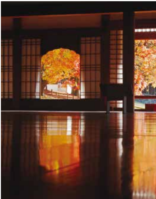
Former Shizutani school

*Contents are subject to change without prior notice depending on the reservation date, and weather and sea conditions. *Two activities are scheduled for this route. *Specific activities vary with each departure, and details will be shared after boarding the ship. Tour includes 3 breakfasts, 2 lunches, 3 dinners