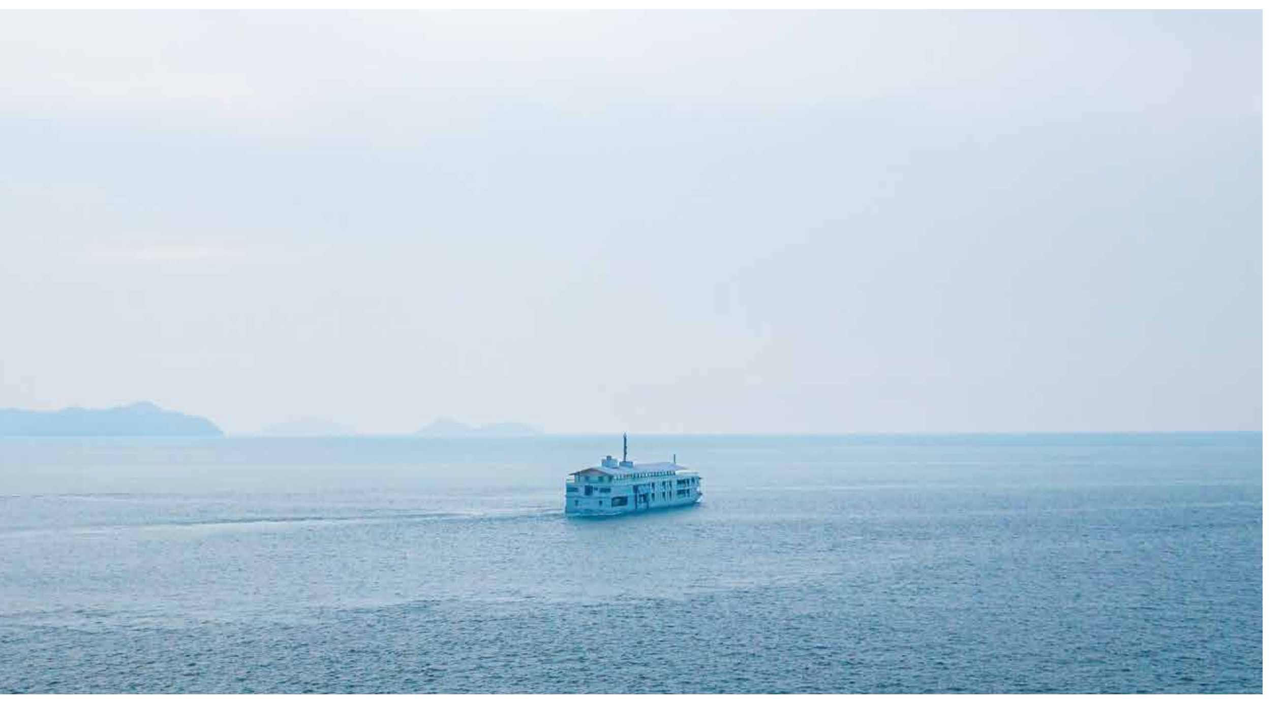
Guntû sails the spring seas

This journey offers an exceptional experience of guntû's Setouchi roaming" style of travel. After passing through the Onomichi Channel and cruising the narrow waterways and dramatic island-dotted seascape of the Geiyo Islands, guntû anchors overnight in the calm shelter of an island bay. After the second day, the voyage continues into the open waters of Hiuchinada, then heads east through the ever-shifting and picturesque scenery around the Shiwaku Islands and the Great Seto Bridge. Each place and moment reveal distinct impressions as you drift across the Inland Sea. Enjoy a quintessential guntû experience of an unhurried four-day journey that captures the true pleasure of traveling where the wind takes you.