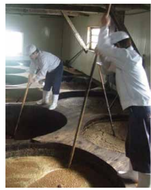
Soy Sauce Brewery