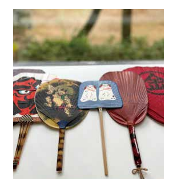
Marugame uchiwa fans