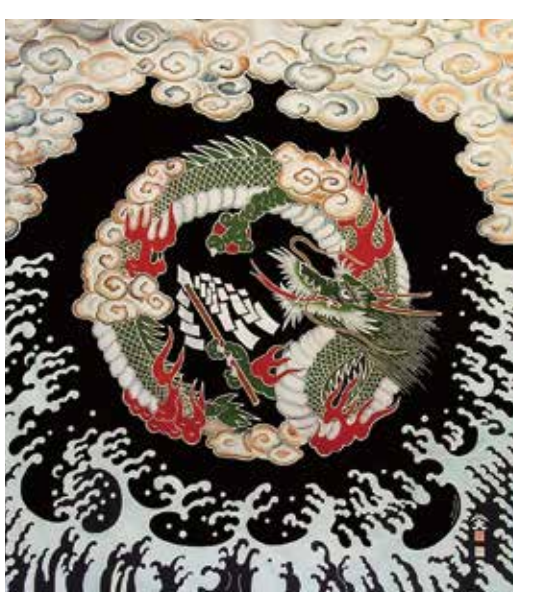
Visit a Sanuki nori dyer who uses viviad colors

*The destinations of activities change depending on day of departure. Details will be shared after boarding.