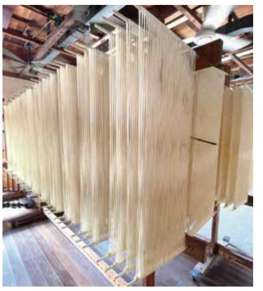
The process of somen noodles