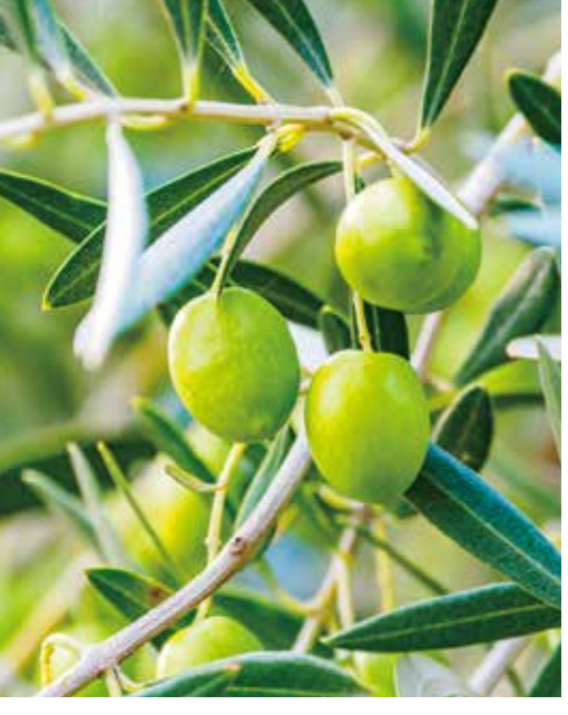
Olives nearing harvest

• Experience of tea ceremony at the Lounge