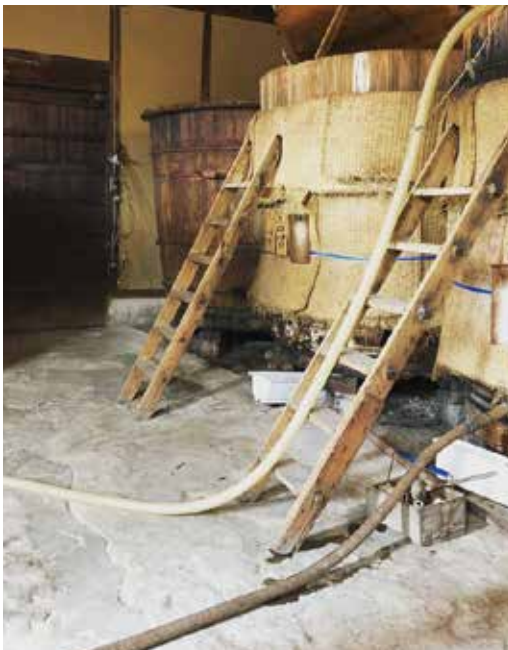
Vinegar made in cedar casks in Nio