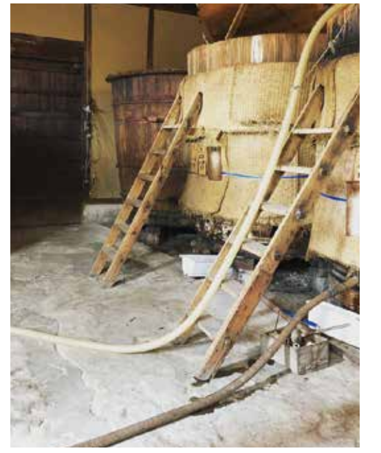
Vinegar made in cedar casks in Nio

*The destinations of off-ship activities change depending on day of departure. Details will be shared after boarding.